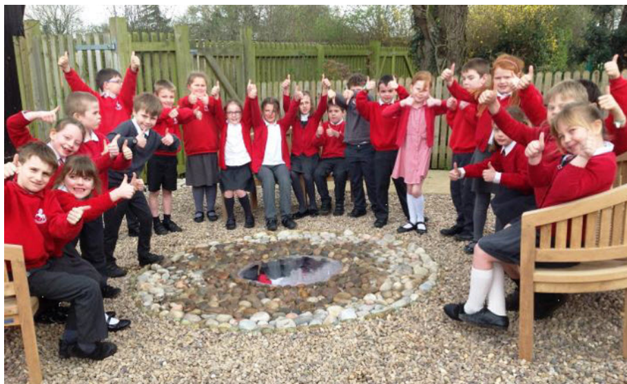
Class 3 open the new reflection garden.

groups, including beginners, to celebrate their talents in front of children and parents. On the sports' front, a team of eleven enthusiastic children entered the Shipston Swimming Gala and were a credit to the school with their effort and team spirit.