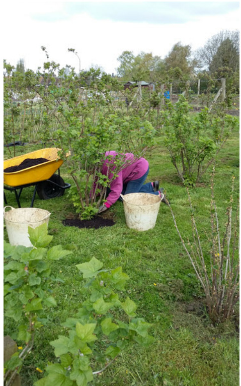
Tricia and the Blackcurrants

So much work has been done in the last month, all the trees weeded and fed and with watering and mulching well under way. Some of the soft fruit has been fed and mulched and the weeding is well under way. A new fruit cage has been constructed to protect the red and white currants as the birds are really partial to them. And of course the mowing has started in earnest to keep the weeds down!