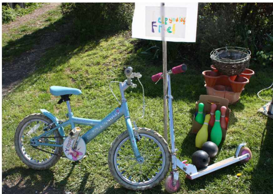
Spring Clean in Oxhill - Free for the next generation of children