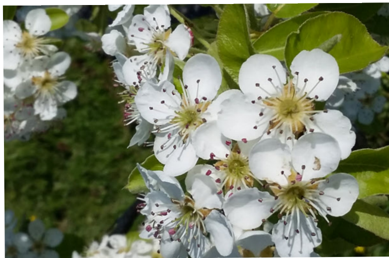
Pear Blossom Onward