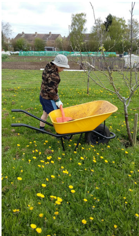
Joe mulches trees