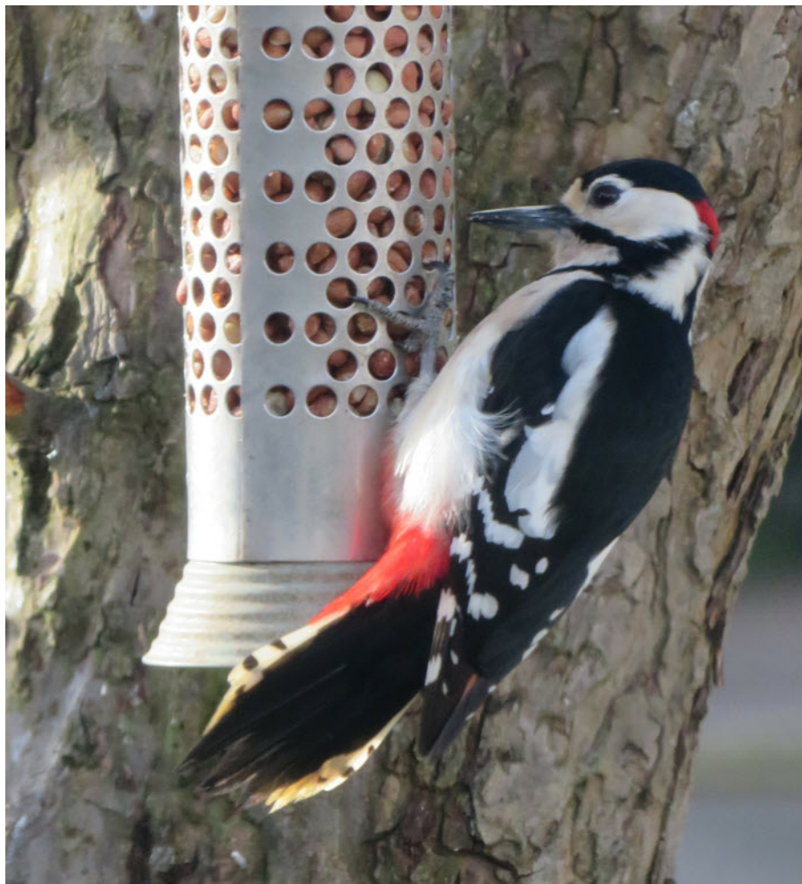
Great Spotted Woodpecker

A frequent visitor to our garden. ~ Tricia Harbour