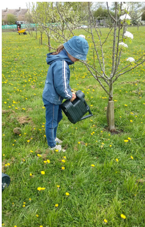
Emily Watering Trees