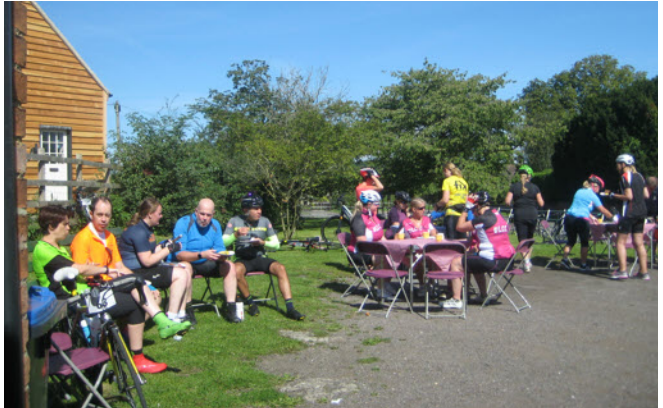
The Shakespeare Bike Ride stopped in the village to refuel and refresh on a sunny day in August .

If you are keen to help - likely to be some painting work, maintenance of guttering, cleaning and clearing up in the kitchen and bar areas, tidying up outside the hall - you will be very welcome. Just come on down or speak to a committee member. We will aim to start at 10am .