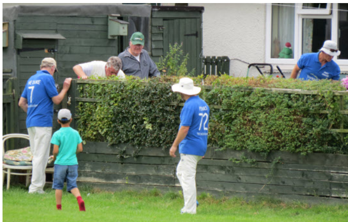
Looking for a cricket ball batted into a local's garden.