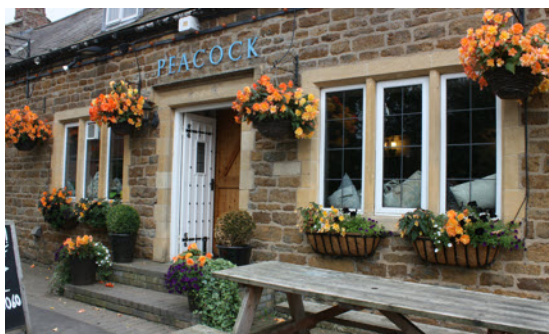
The flower baskets at the Peacock Inn look very good. ~ Patrick Crowther

Weekday Walkers usually walk on the 2nd and 4th Fridays of each month. If you are interested in joining or to find out further information, please contact Jim Saxton on 680613 or saxton@talktalk.net